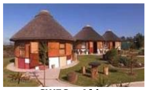
www.SWEG - Africa.com