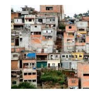
www.SWEG - America.com