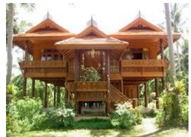
www.SWEG - Asia.com