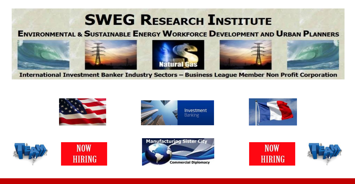
U.S.A. / France / African Investment Bankers Chapter Office Employee Salary Payroll Investment

The Foreign Chapter Office Staff – Annual Salary & Operations Cost will be Paid in each of our initial U.S. State market areas, as well as in each of the 13 Metropolitan Regions in France, and the 13 initial Sub-Saharan African countries.