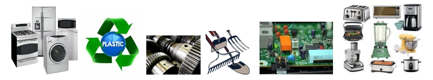
Exhibit Small Manufacturing Industry Sectors – Component Part Supply Statistics Data