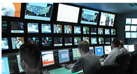
Television Banking Industry News

www.CapitalStreetBusinessNewsTelevision.com