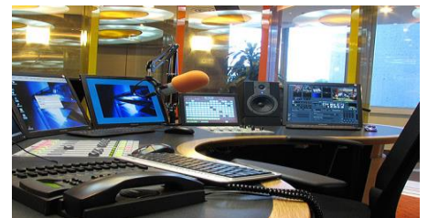
Radio Banking News Contributor