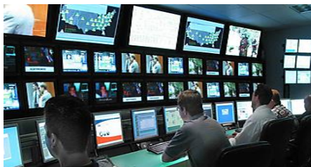
Television Banking Industry News