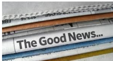
Banking Newspaper Columnist