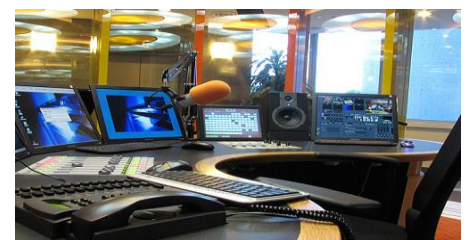
Radio Banking News Contributor