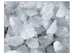
Alumina & Crystallized Aluminum